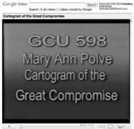
Figure 3.—The program uses different modes of delivery of material, including (a), streaming of videotaped presentations, (b), voiced over PowerPoint presentations, and (c), the media site mixed format.